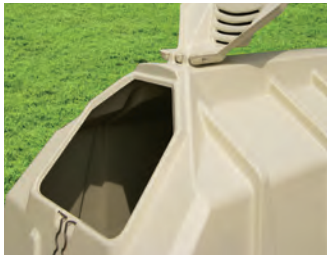
Largest Bedding Door of its kind.