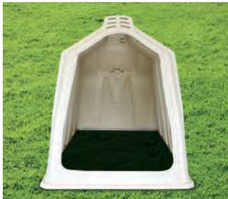
Also available with a Full Open entry