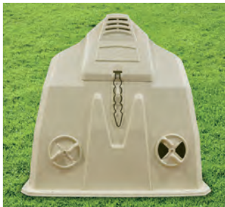
Optional supplemental air vents