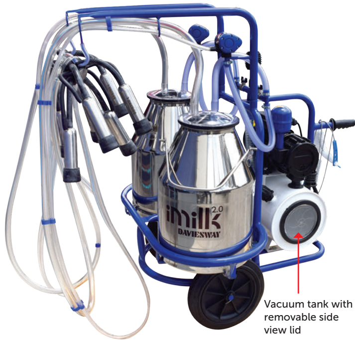
Vacuum tank with removable side view lid